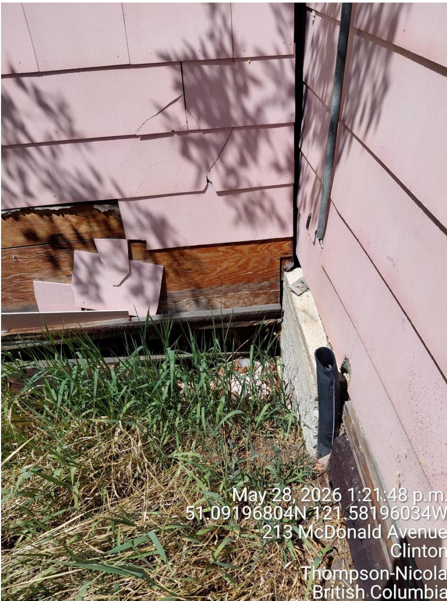
Image showing access point to the home