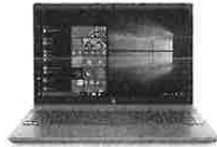
HP Pavilion 15-cw1027ca 15.6-inch Laptop, AMD Ryz...