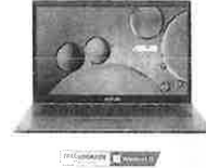
ASUS Vivobook 14 M415DA- SS31-CB 14.0" FHD Laptop...