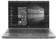
HP Pavilion 15-cw1017ca 15.6" FHD Touch Screen...