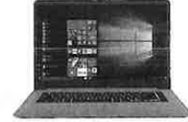
Asus VivoBook X510QA- SS12-CB 15.6" Notebook, ...