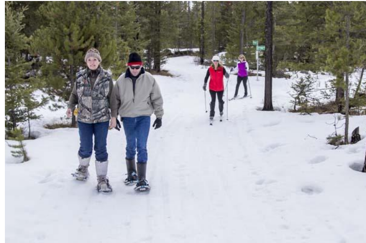
Snowshoeing & Cross Country Skiing