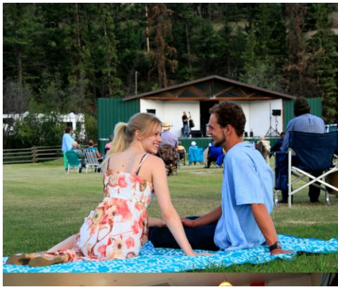
Music in the Park