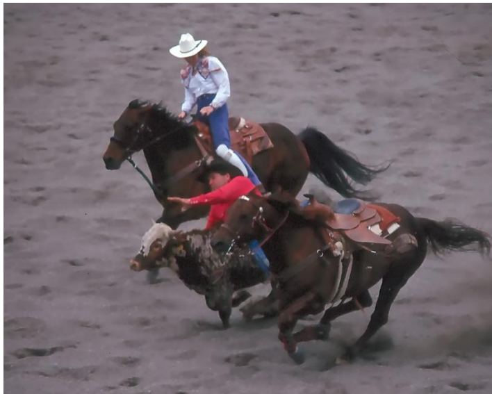
Rodeo excitement – Steer Wrestling