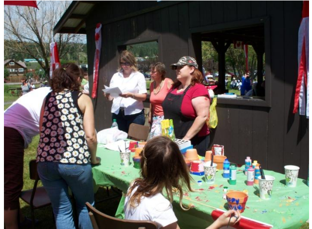
Canada Day Kids Painting Station

Clinton has recreational and community opportunities for everyone, no matter what your interests may be, we have something for you to do!