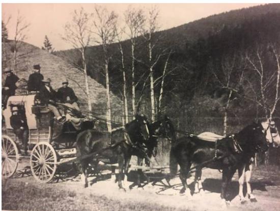
Top Left – Famous Clinton Hotel circa 1869