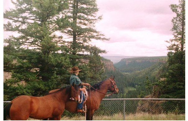
Early morning trail ride at Chasm Park

For the History enthusiast, our Museum and antique shops will spark your imagination of days gone by and keep you searching for that hidden treasure. Come and explore "where history meets adventure".