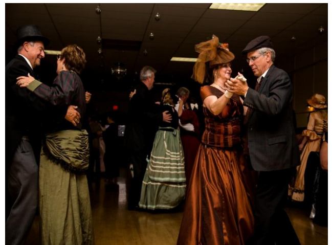
Dancing the night away at the Annual Ball

The Village of Clinton is a quaint community with 650 residents that are happy to welcome you to their community. The lifestyle is relaxed and full of recreational opportunities, with city amenities just 40 minutes drive away. Clinton is a wonderful place to grow up, raise a family or enjoy your senior years. Business opportunities are plentiful for the entrepreneurial spirit . We invite you to visit, stay , invest, work and play.